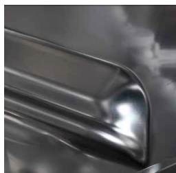
Lightweight composite impellers, efficient even at low mains pressure