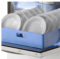
Printed basket runners