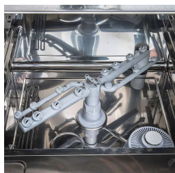
Moulded and sloping basin for perfect emptying