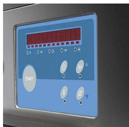
ALL-IN-1 This innovative system was developed to facilitate daily maintenance and cleaning of the machine