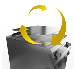
Plate not welded to the machine bed with optimisation of structural points under thermal stress

Water dispenser kit available as an accessory