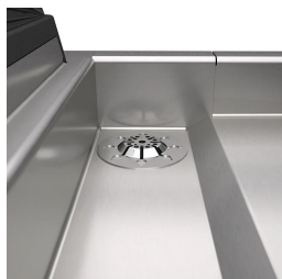
Table top with standardised tank and liquid drainage in the rear right-hand corner.

10 kW or 14 kW enameled cast-iron burners removable for easy cleaning.